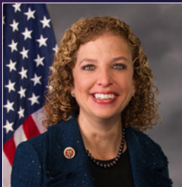
Congresswoman Debbie Wasserman Schultz

The Greater Fort Lauderdale Chamber of Commerce and Congresswoman Debbie Wasserman Schultz invite you, as a business leader in our community, to participate in the South Florida Delegation's Florida Power & Light Company 2021 Washington Summit, presented by Nicklaus Children's Health System.